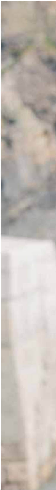
Burhou, the Traditional Guersney in Loden Green