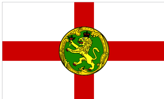
The flag of Alderney

Looking back at the time that the original Alderney jumper first came into being, many other knitting patterns were also in use. The unique design of our Alderney incorporates both the original features of the Alderney plus additional patterns relating to the time of its conception. This distinguishes it even more so from the traditional Guernsey.