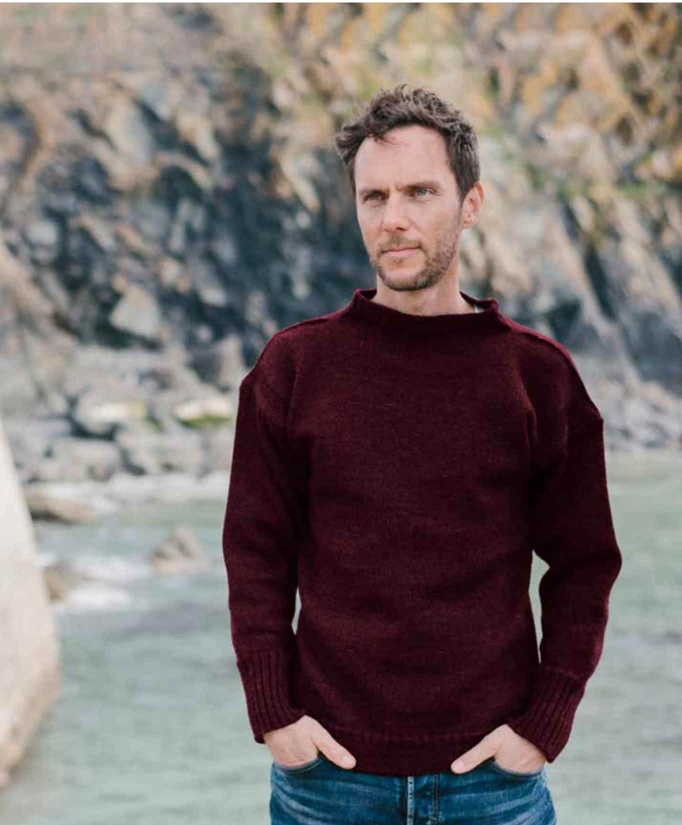
Burhou, the Traditional Guersney in Burgundy