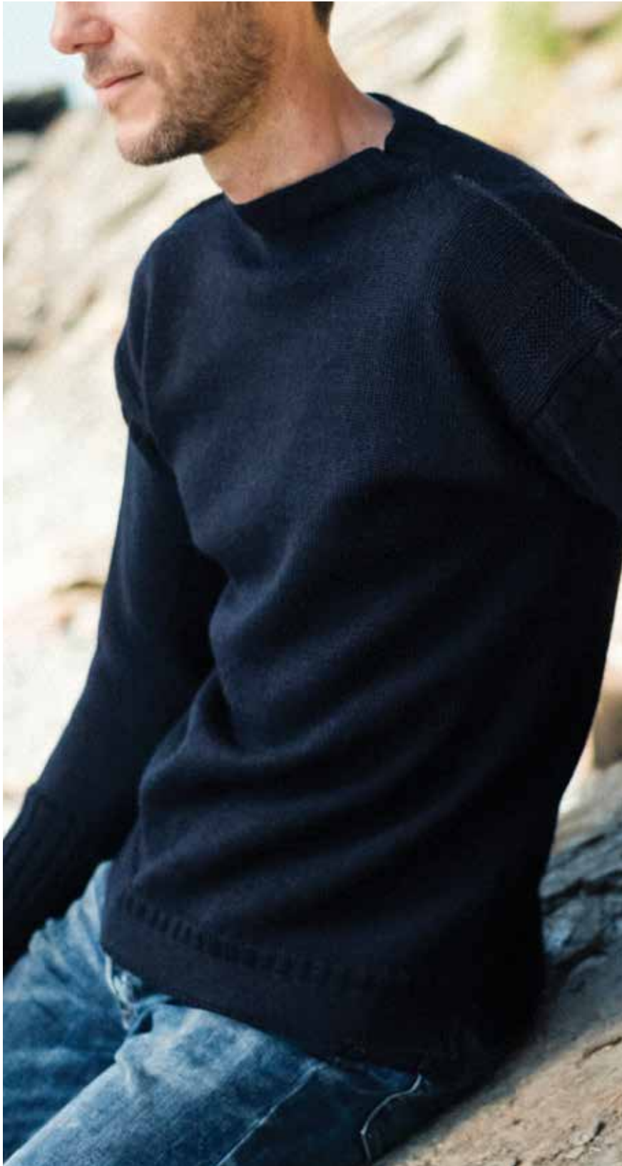
Our Traditional Guernsey is unisex and can be worn front-to-back